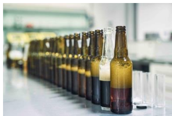
Example of recording volume checks for packers