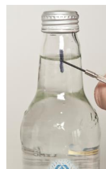
Figure 4: Marking of Level

The OIML G14 document already provides a method for determining the density of a carbonated beverage that involves marking a line on the actual fill level of the bottle neck, replacing the carbonated liquid with distilled water, which then allows the density to be calculated. This method is suitable for containers that are non-deformable and transparent. It is therefore not suitable for dark bottles as the meniscus is not clear, plastic bottles which are not rigid and cans. The scientific metrologist has also concerns with the level of uncertainty introduced by the procedure, as it can be very subjective for the operator to accurately mark a line at the correct point.