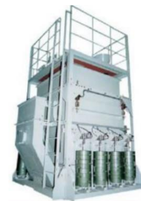
Discontinuous totalizing automatic weighing instruments (R 107)