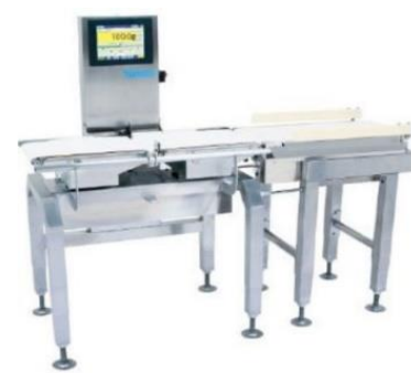
Automatic catch weighing instrument (R 51)