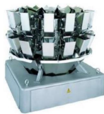
Automatic gravimetric filling instruments (R 61)