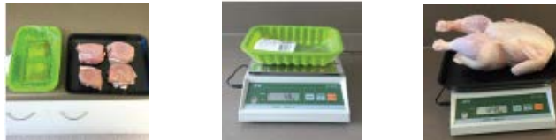
Examples of testing poultry weight