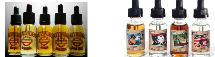
Examples of electronic cigarette e-liquids