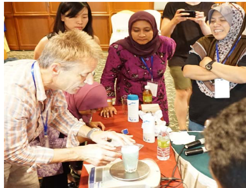
July 2016 - Train the Trainer for Pre-Packages Control

Main Implementation Partners: ACCSQ and related Horizontal & Product Working Groups