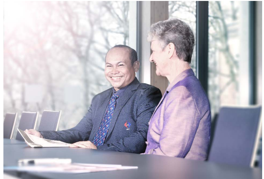
Members of the MEDEA Coordination Committee

Main Implementation Partners: APMP & APLMF