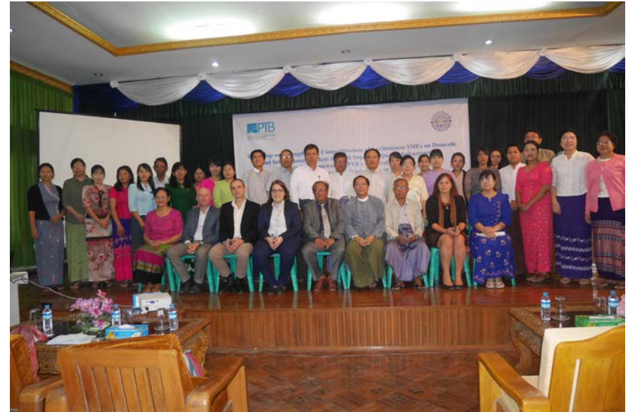
January 2017 – Workshop on QI services for agriculture