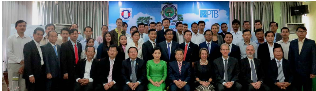
June 2017 – Project Planning Workshop in Phnom Penh